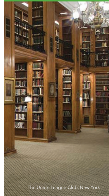
The Union League Club, New York